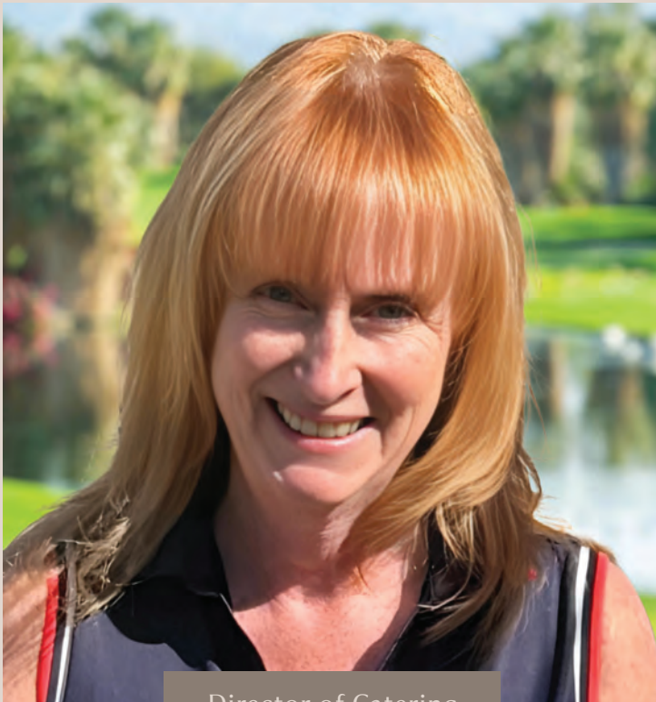
Director of Catering